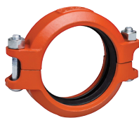
1 – 8"/DN25 – DN200